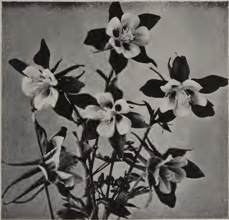
AQUILEGIA CRIMSON STAR. A large flower of rich velvety red with cream center of startling beauty and contrast. A novelty of great value for the hardy border and as a cut flower. 3 for $1.00.